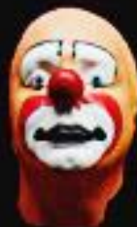
Clown Mask 2