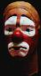
Clown Mask 3