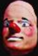
Clown Mask 1